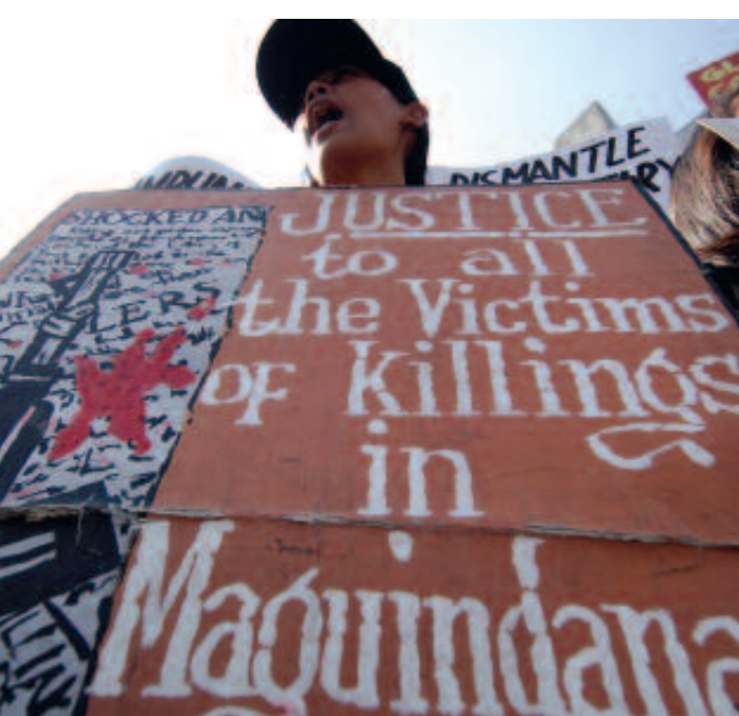
Raised voices: Protesters at the Philippine National Police headquarters in Quezon City.

"There is no pressure, just the possibility of pressure, which I guess in itself is pressure," he said. "This is what happens when governments act outside the law, when people think they are above the law and there is the belief that misdeeds are unpunishable." The Philippines Supreme Court agreed to move the murder hearings to Manila in response to the threats and expectation of threats, yet the Government has resisted calls to establish a special tribunal to investigate the massacre, despite the scale of the undertaking.