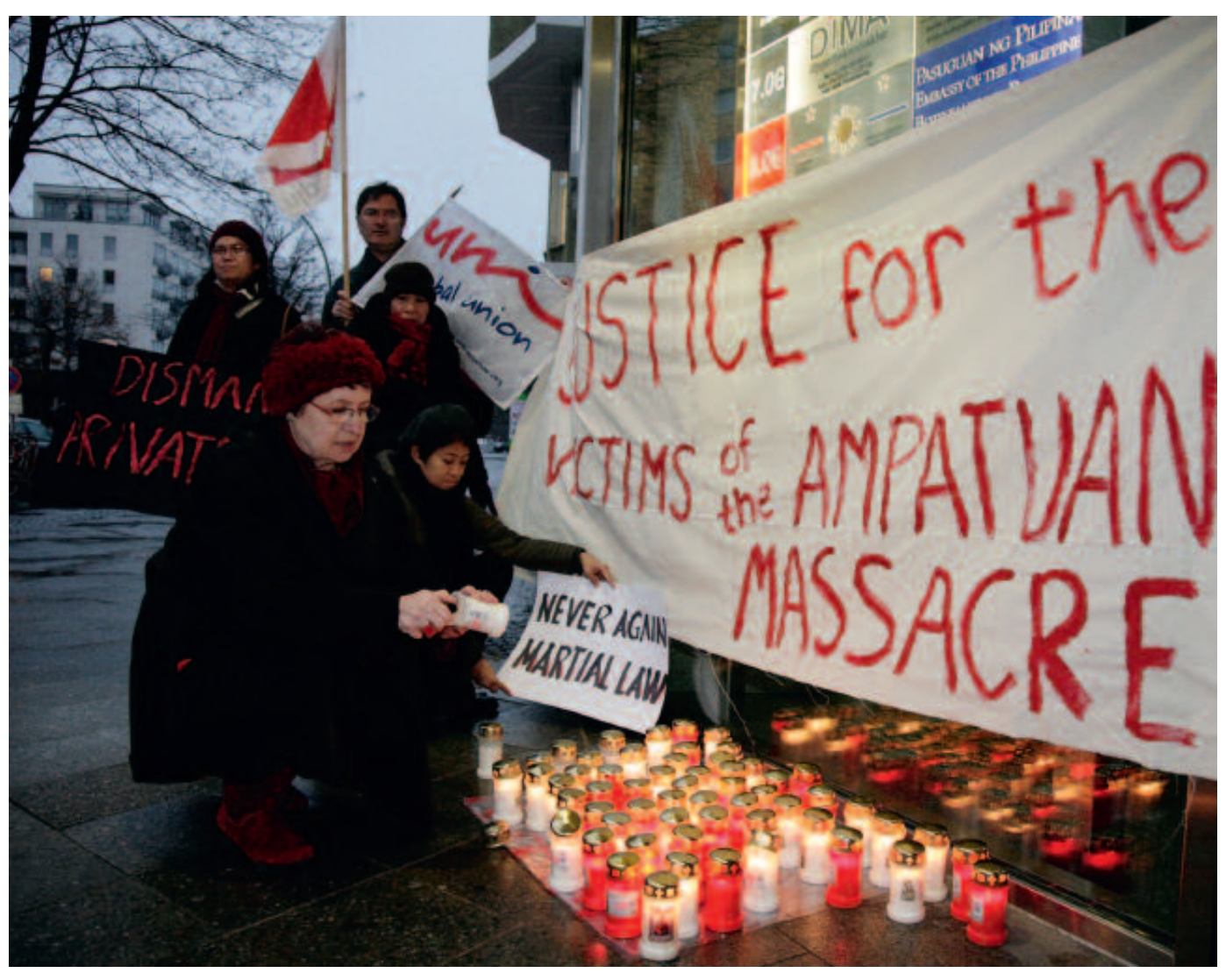
We will never forget: Protesters light candles for the victims at a vigil in Berlin.

developed by the NUJP and the families to formalise an organised structure for future action.