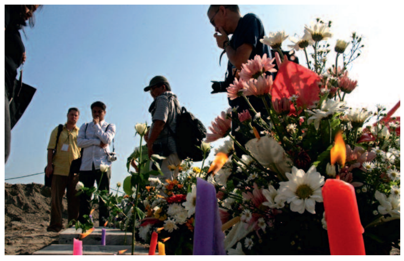
Members of the International Solidarity Mission visited the graves of 12 of the slain journalists at the cemetery in General Santos City

never angry with the Ampatuans, we will forgive them. We hope God will also do so."