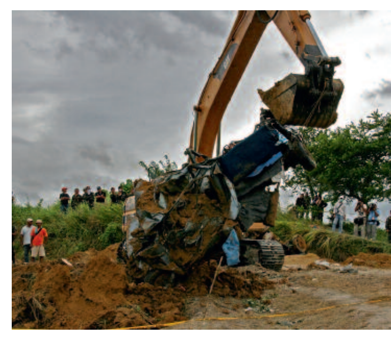
A terrible site: The killers had not finished burying the evidence of their atrocity.

Five vehicles are also found in the area, as follows: four Toyota Grandia with plate numbers MVM 789, MVM 884, MVM 885 and LGH 247, one Pajero with plate number MCB 335 and one backhoe. Other items seen at the site include various personal items, assorted empty shells and other documents. Troops immediately secure the area prior to the arrival of the PNP SOCO Team for investigation.