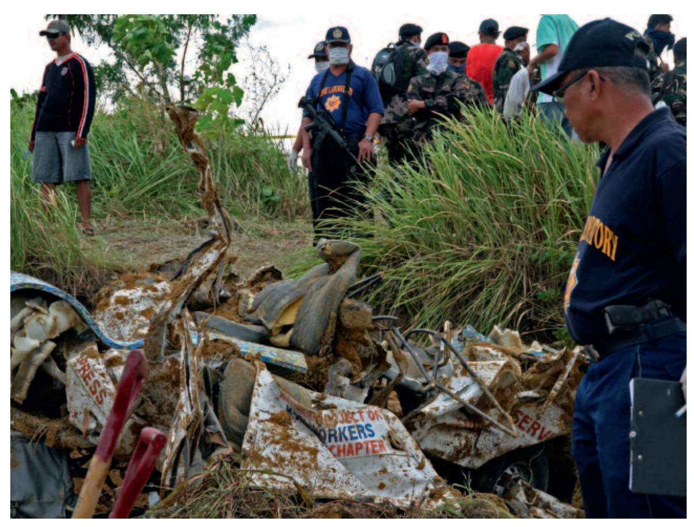
Forensic nightmare: There are concerns that the crime scene was compromised and vital evidence may not have been collected.

a body remains missing, and there are fears there may be more graves to be found.