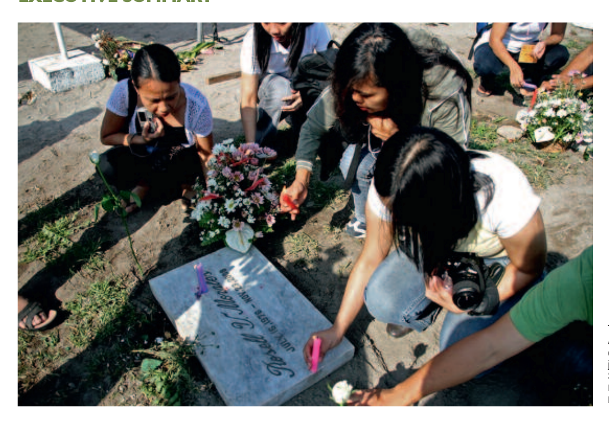
Tears and tributes: At the graveside of one of the slain journalists, General Santos City.

The National Union of Journalists of the Philippines (NUJP), an affiliate member of the International Federation of Journalists (IFJ), invited the IFJ to lead an international solidarity mission to the Philippines to investigate the Ampatuan Town Massacre that occurred on November 23, 2009 in which 57 people were killed, 31 of whom were journalists and media workers.