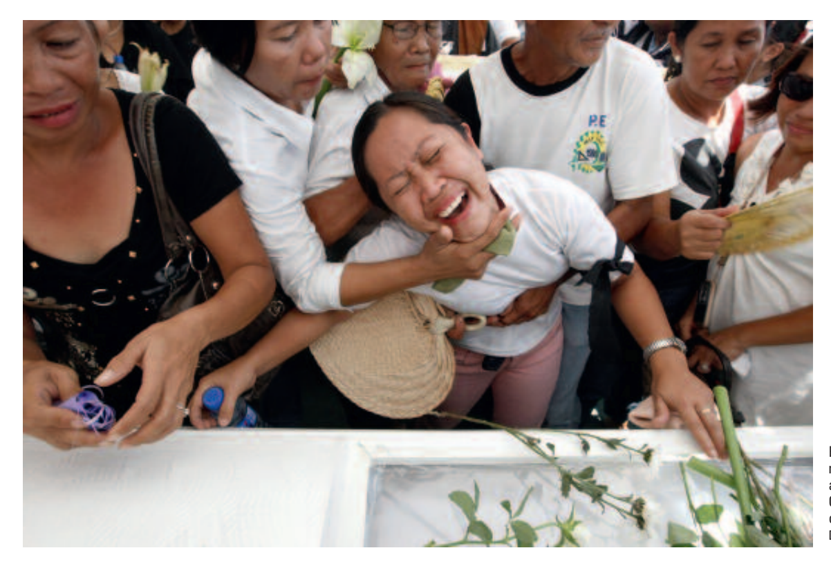
Broken lives: Family members grieve during a funeral ceremony at General Santos City cemetery.

On December 8 the mission members including NUJP leaders gathered to draft a preliminary mission report and recommendations.