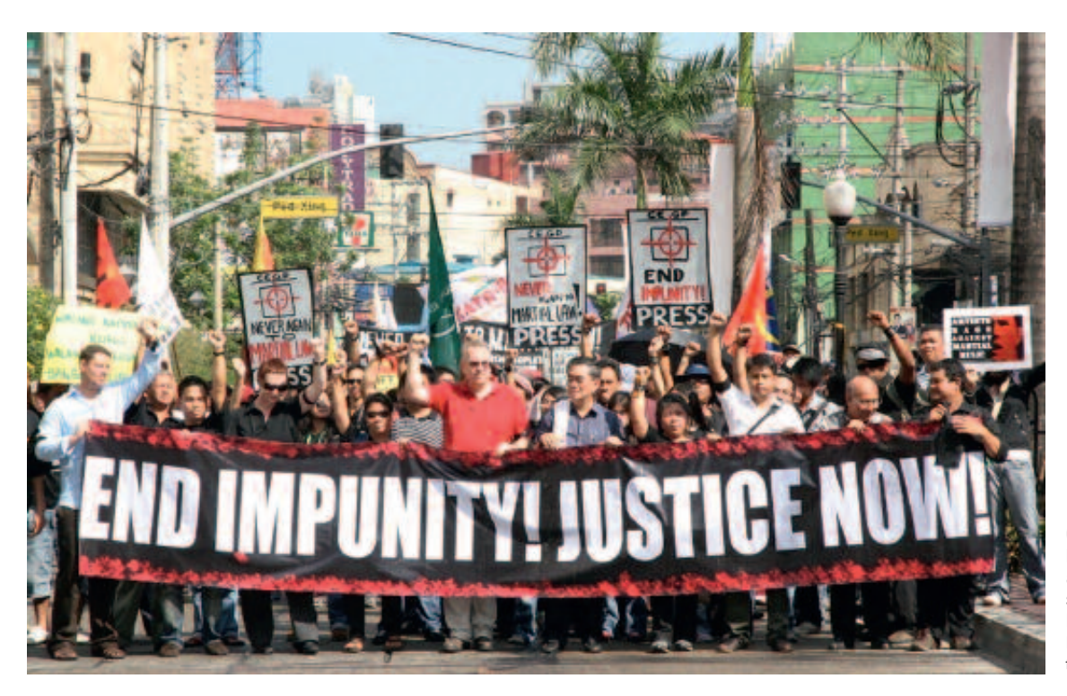
Collective outrage: Mission members lead a protest through the streets of Manila, December 9.