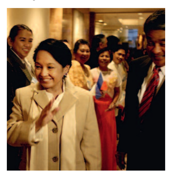
Gloria Macapagal-Arroyo: More than 100 journalists have been killed during her administration.

The Ampatuan Town massacre was perpetrated on November 23, 2009 against at least 57 unarmed civilians, 31 of them