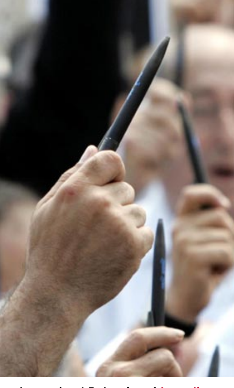
International Federation of Journalists