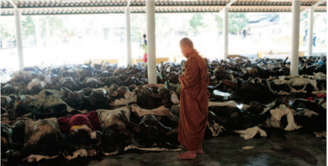
A buddhist monk looks after the bodies at the Yan Yaow Temple in Phuket, Thailand, on December 30, 2004.

assistance to the public. This included services from its Tuticorin station in the southern state of Tamil Nadu to assist victims in India and in nearby Sri Lanka. http://www.newssafety.com/stories/bbc/indo05.htm