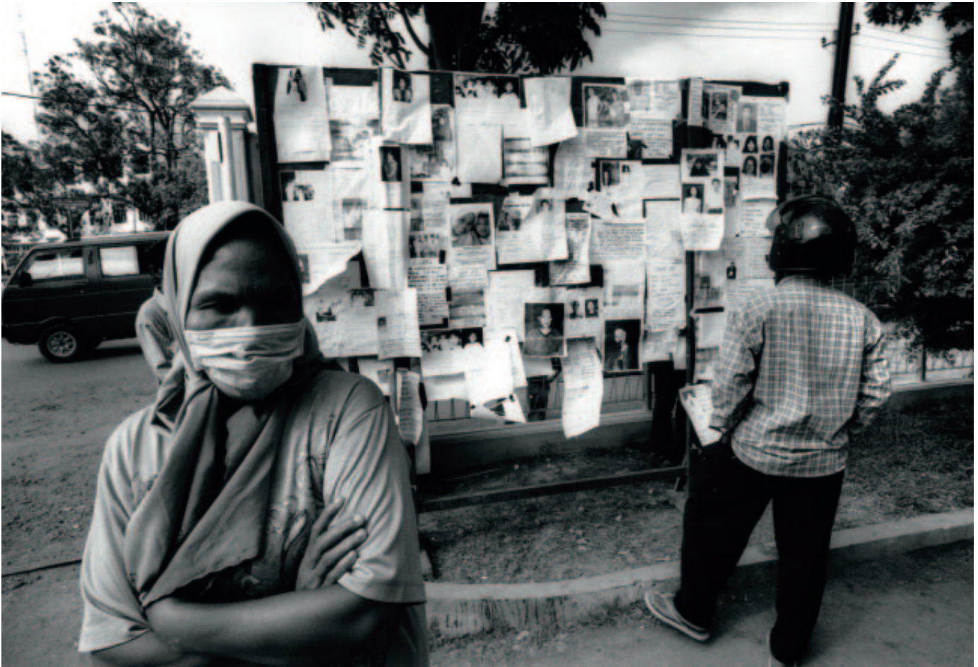
Tsunami survivors study hospital noticeboards in the hope of finding news of missing loved ones.