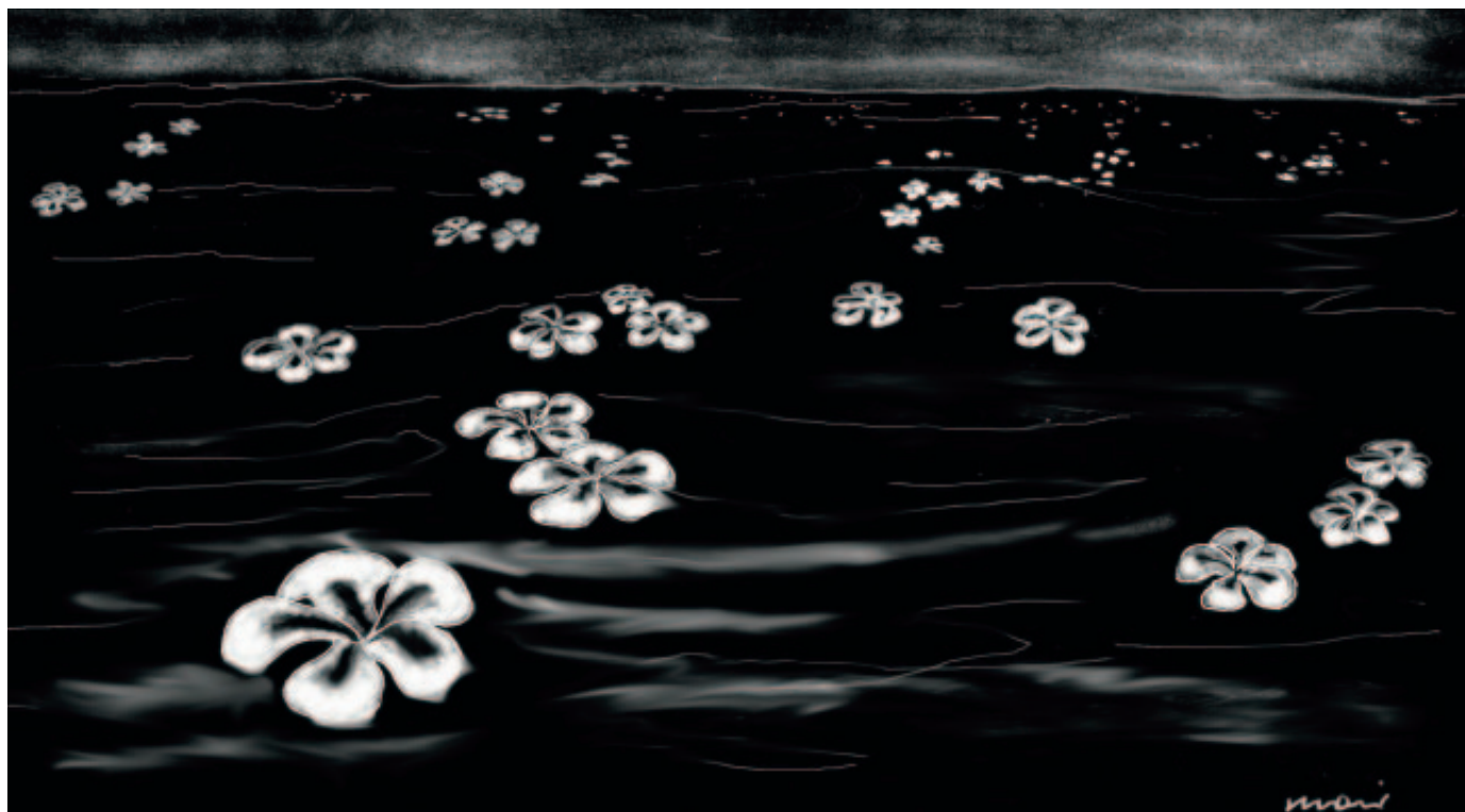
Alan Moir/The Sydney Morning Herald

Amnesty International (AI) is monitoring the relief effort to ensure that fundamental human rights are respected. These include the principle of non-discrimination in aid provision, principles guiding protection of human rights in situations of internal displacement and the right to protection from physical or mental abuse, including violence against women.