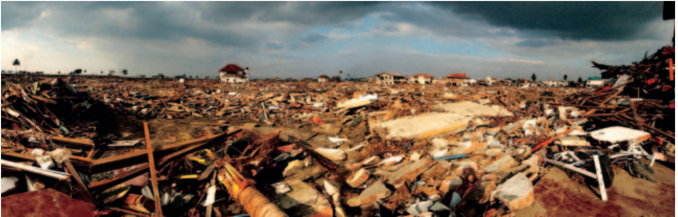
A composite panoramic photograph of three photographs showing the destruction of Banda Aceh caused by the earthquake and tsunami.

T he massive earthquake and subsequent tsunamis devastated a number of communities in a dozen Indian Ocean countries on 26 December 2004. The death toll reached over 286,000 with another half a million people injured and many more homeless. The tsunami proved to be an enormous test, for governments, aid organisations and media. In the first 48 hours relief efforts in many regions were coordinated by the media.