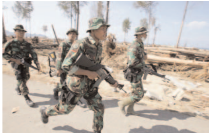
TNI soldiers run after gun shots from rebel snipers in the ruined GAM (Free Aceh Movement) stronghold Lhoknga, on tsunami ravaged Sumatra on January 6.