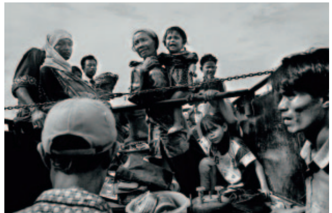
Internally displaced People board a lorry to flee the city of Meulaboh, Aceh.

"We felt like we had to immediately be available again for the Acehnese as we were the only daily here and we had to